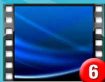
6 Soft Blues

(preview these videos on our multimedia page at www.smdra.com )