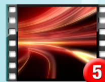
5 Red Warp

(preview these videos on our multimedia page at www.smdra.com )