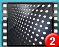
2 Circular Grid Array