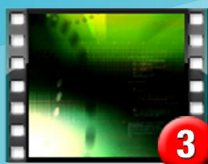
3 Green Circular Grid