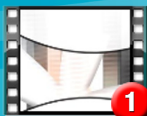
1 Abstract Snow

What would you like on your title screen? For example your name, company name, titles, your email and/or website address, phone number etc. **PLEASE PRINT CLEARLY**